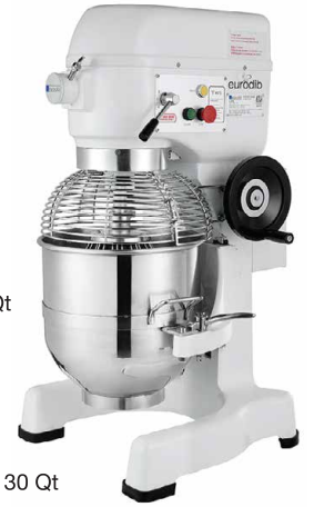
M30 ETL220 - 30 Qt