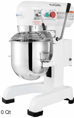
M10 ETL - 10 Qt

★ M10 ETL, M20 ETL and M30 ETL are NOT SUITABLE for pizza, pita or bread dough. Stop the machine to change speed. Do not mix dough at middle or high speed.