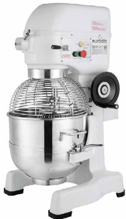
M40A 220ETL - 40 Qt