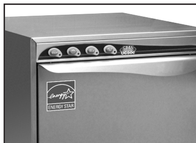
Top mounted controls are easy to read and simple to operate.