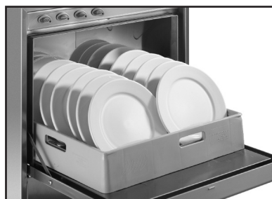
Large 13" maximum loading height door clearance accommodates oversized plates, glasses and utensils.