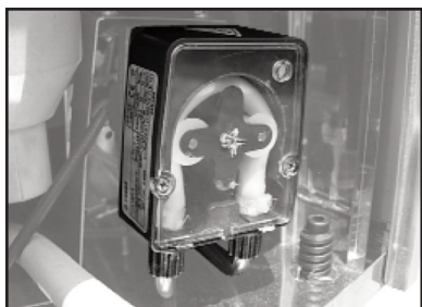
Built-in detergent and rinse chemical pumps.