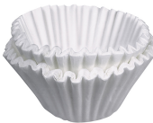
FILTERS,REGULAR1M 500/2 50/CL